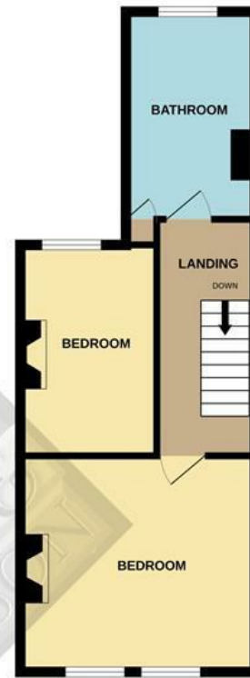
1ST FLOOR 397 sq.ft. (36.9 sq.m.) approx.